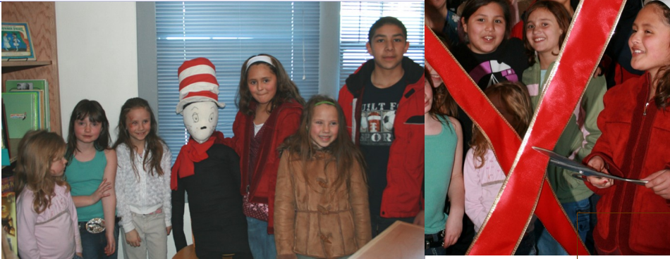
Sage Student Council at the library opening.