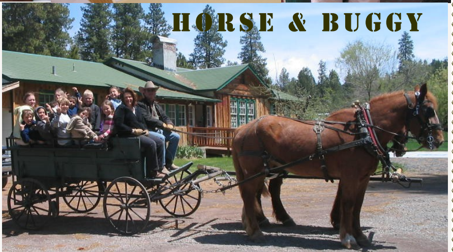
HORSE & BUGGY