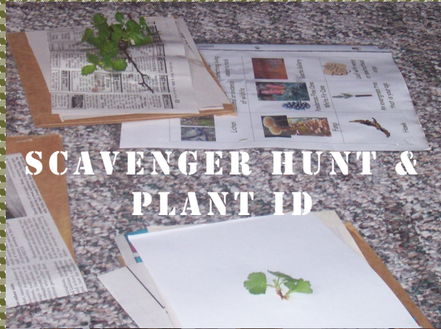
SCAVENGER HUNT & PLANT ID