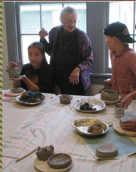
P O T T E R Y