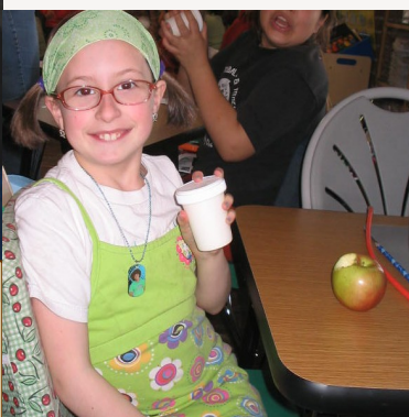
Grade 1/2 shake, shake, shake turning cream to butter.